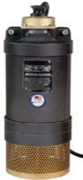
Piranha Model PP-500-HH 5 HP - 230/460 Volt